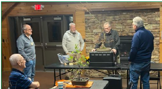
The experts at work - very valuable information and advice