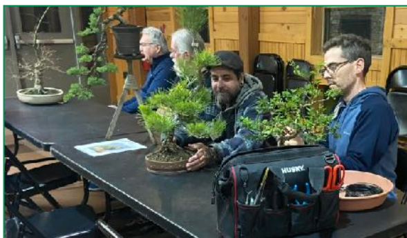
Lots of material to work with - waiting for class to start