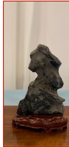
Figure Stone in hand carved Daiza by Bob Blankfield displayed at the 8th US National Bonsai Exhibition