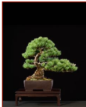
Award winning Japanese 5 Needle Pine Miyajima