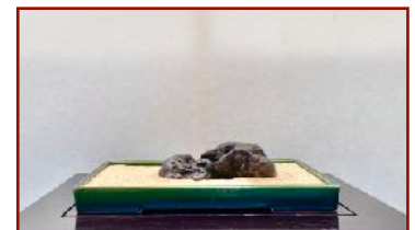
Mountain Lake Suiseki in Suiban with sand

Tuesday, October 22 7 pm - Club meeting, Study group Exhibit, presentation on collecting by Les Allen