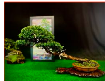
Pacific Rim Bonsai preparations

Shohin Bonsai Seminar - January 30 - Feb 1, Santanella, CA www.calshohin.org