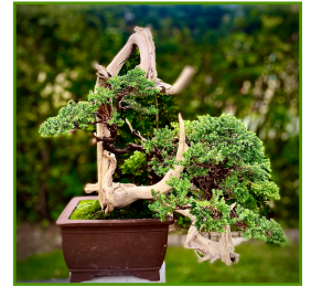
A Star is born, Grand Bonsai Ride taking shape.