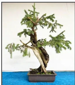
Bill's Demo before repotting