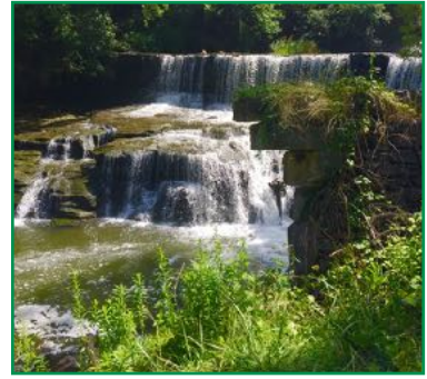
Idyllic secret Suiseki collection location

Tuesday, October 22 7 pm - Club meeting, Study group Exhibit, presentation on collecting by Les Allen. Please bring a Suiseki or viewing stone for display and discussion. At this meeting, there will be information about plans for the Suiseki study group going forward into 2025.